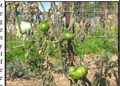
Tomatoes showing frost damage

We expect the shares will be rather sparse over the next several weeks, until everyone gets back up to full production.